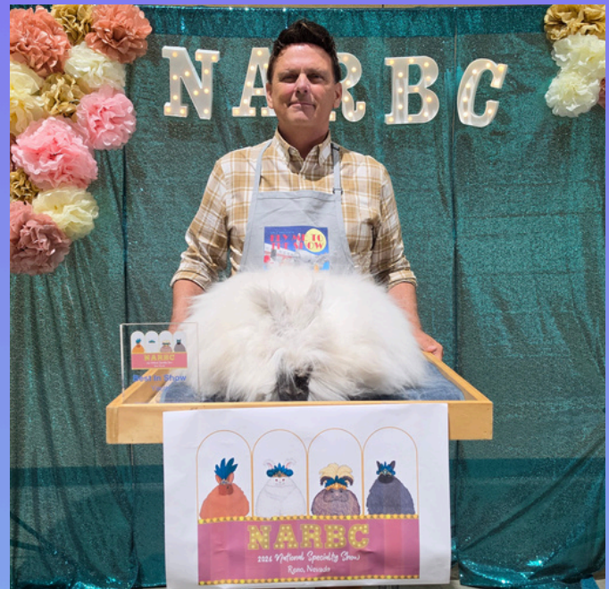
Best of Breed & Best in Specialty Show