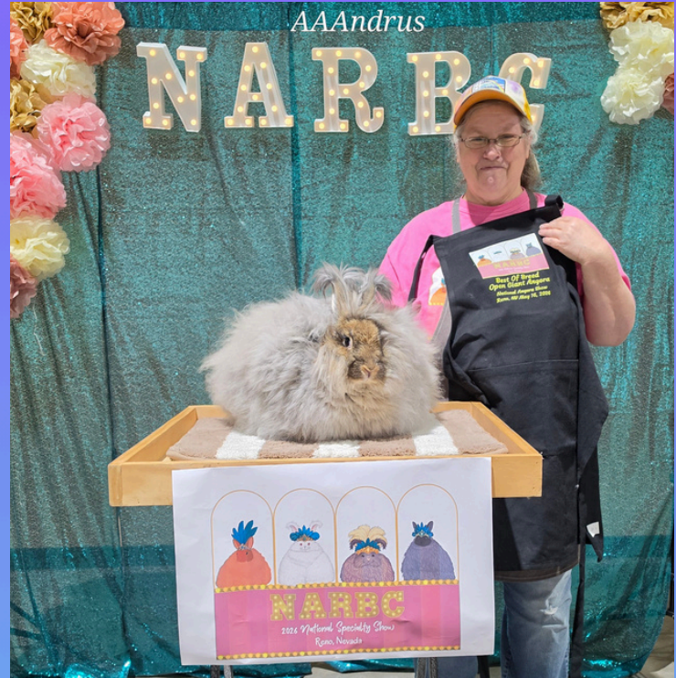
Best of Breed