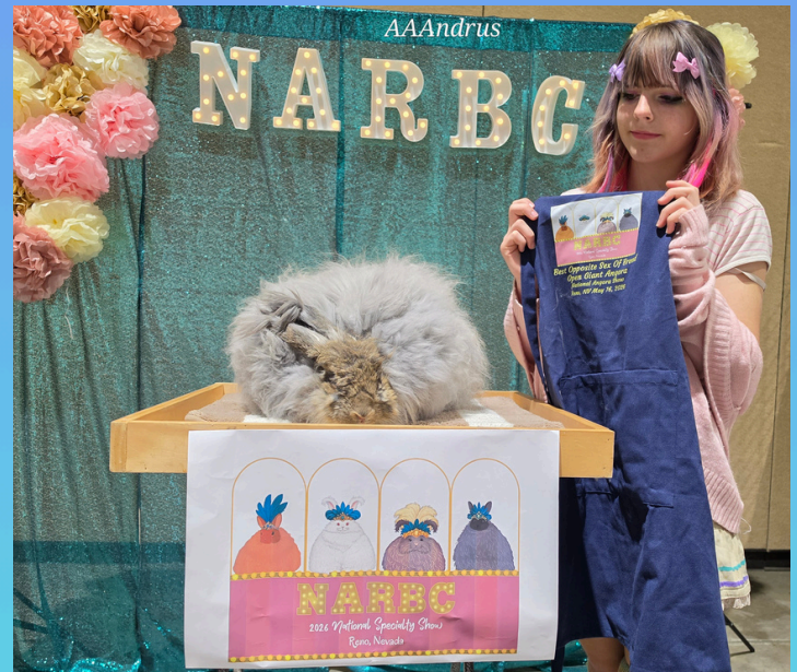
Best Opposite of Breed