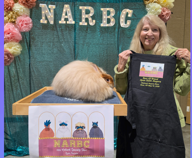
Best of Breed