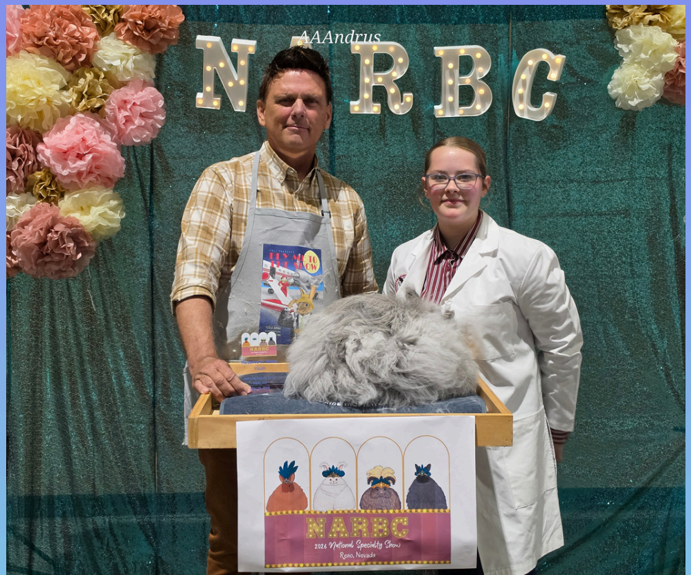
Best of Breed & Reserve in Specialty Show