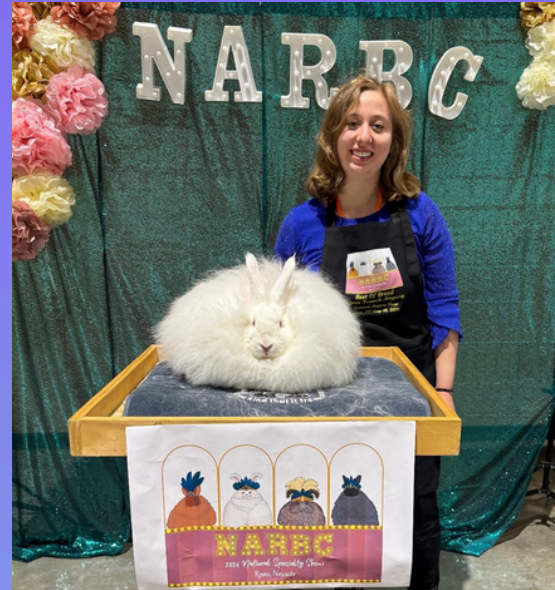
Best in Specialty Show & Best of Breed