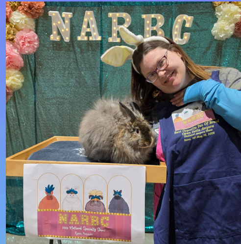
Best Opposite of Breed