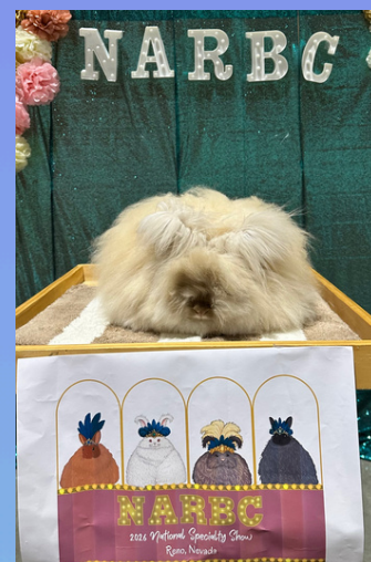
Best Opposite of Breed