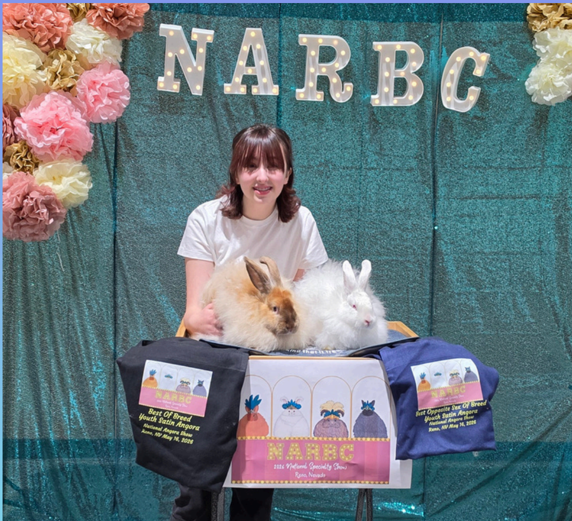
Best of Breed & Best Opposite of Breed