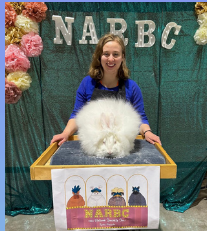
Best Opposite of Breed