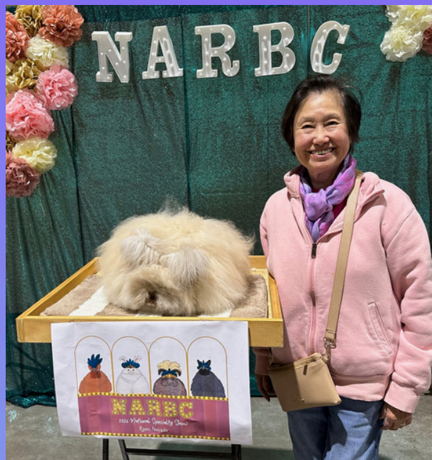
Reserve in Specialty Show & Best of Breed